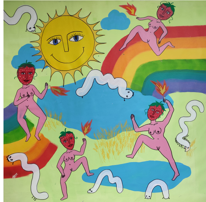
Diptych "Bucha" acrylic, canvas 100*100cm. , 100*100cm., 2022